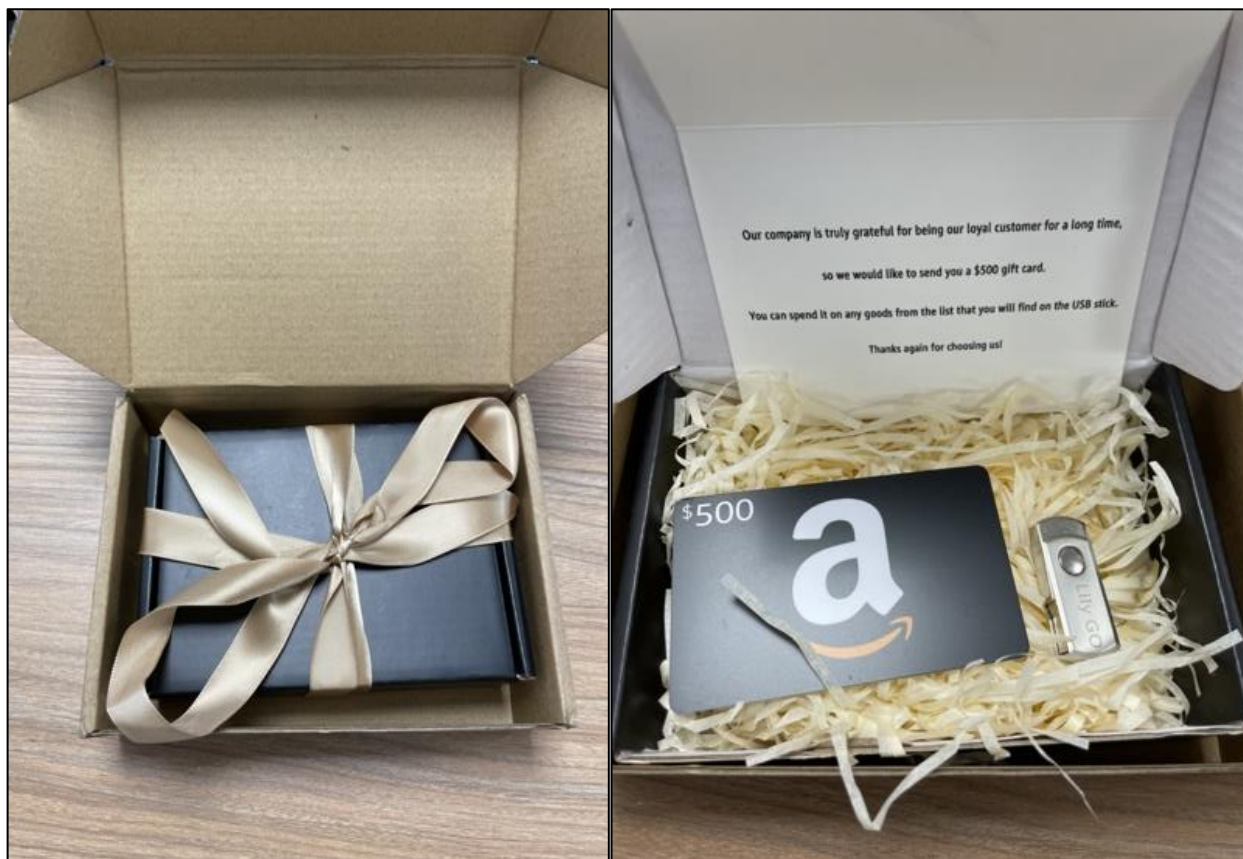
Figure 2. Example of package imitating Amazon

The second variation of the mailings used a decorative box containing a fraudulent thank you letter imitating Amazon with a counterfeit gift card and a USB device.